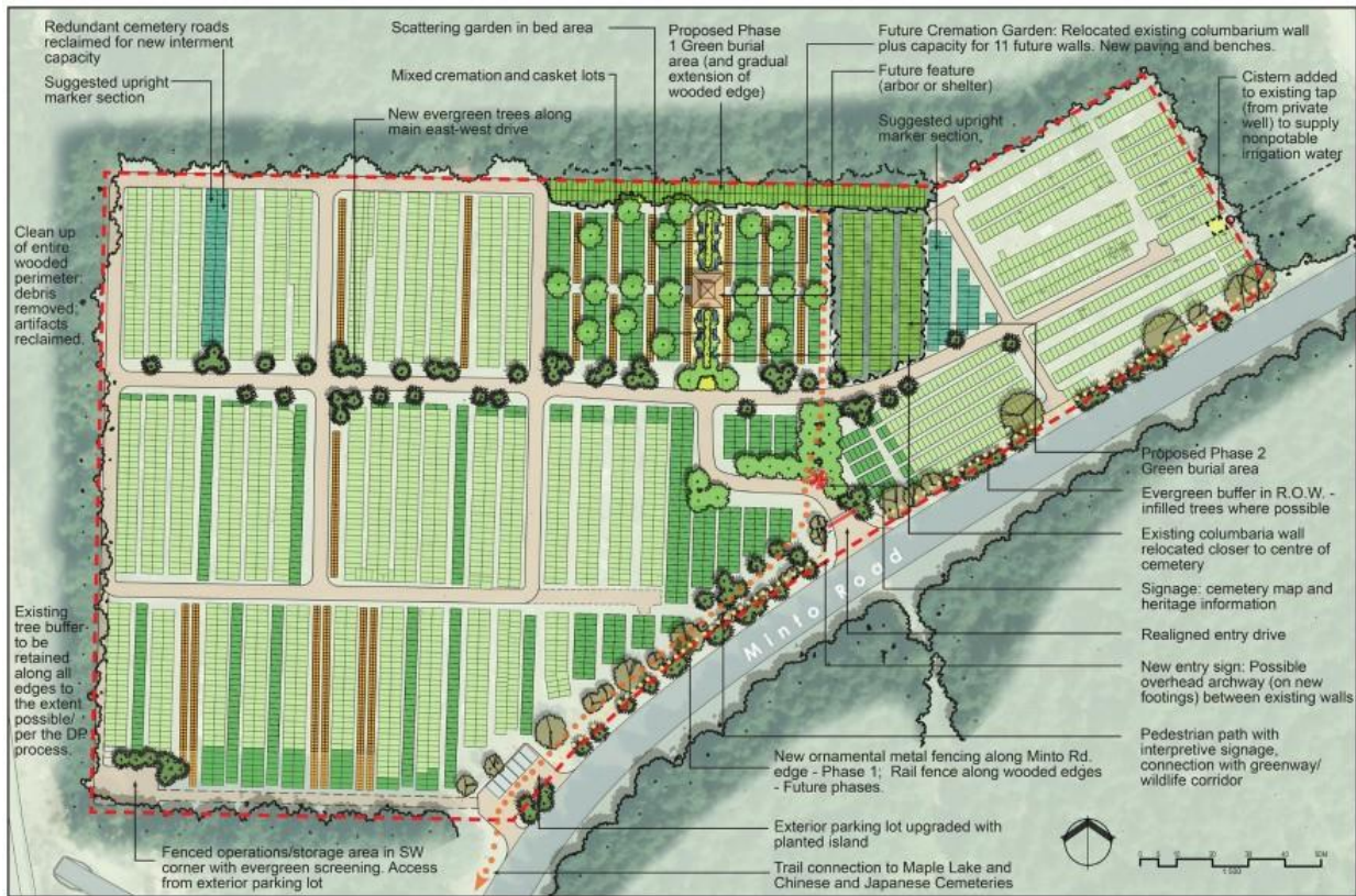
Preferred option for improvements to the Cumberland Municipal Cemetery reflecting the original form and layout of the cemetery. (Lees + Associates 2014)