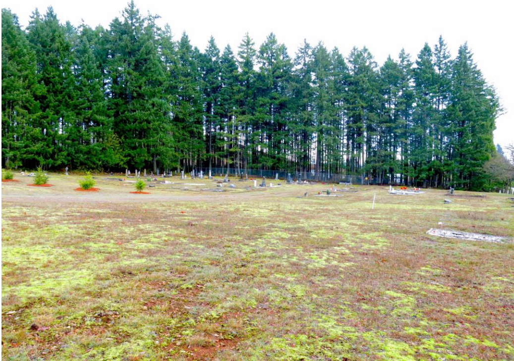
View to the original Catholic section showing surrounding forest and native groundcover species associated with the site.