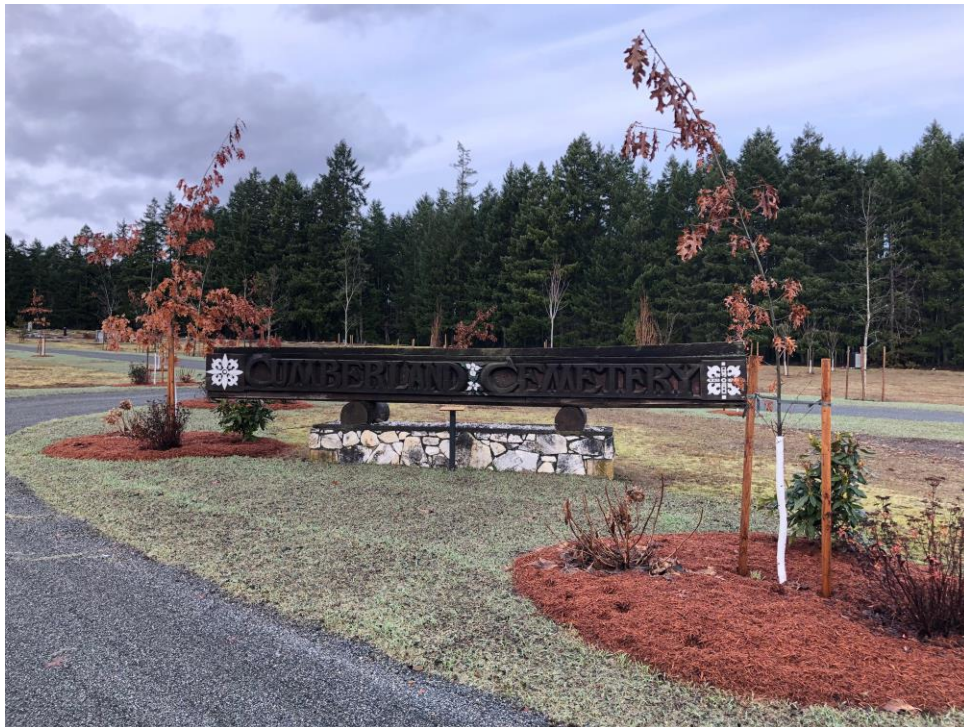
Carved wood sign, new entry road and landscaping.