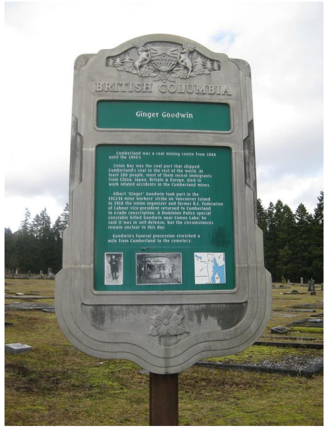
Headstone and provincial stop of interest sign commemorating Ginger Goodwin.